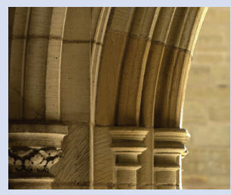
See inside front cover for primary resources